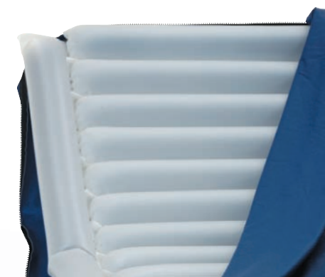
Integrated cell structure

Allows nursing staff to easily identify the foot end of the mattress during installation for correct positioning of patient.