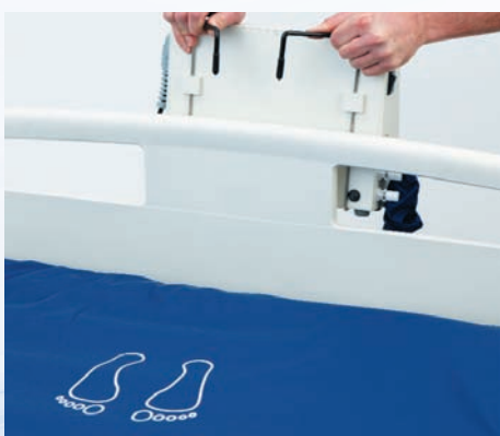
Adjustable hanging brackets