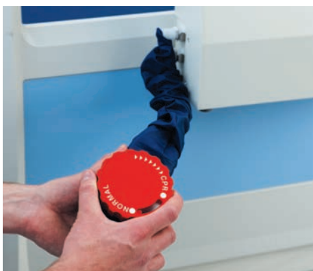
Easily accessible CPR

The NoDec A Air-Stream is a lightweight, portable system with automatic functions and key safety features which ensure that it is suitable for a wide range of care settings from general ward and acute care to private or nursing home care.