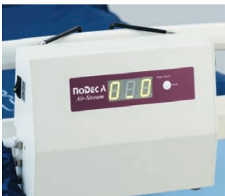
Lightweight Patient Management Unit