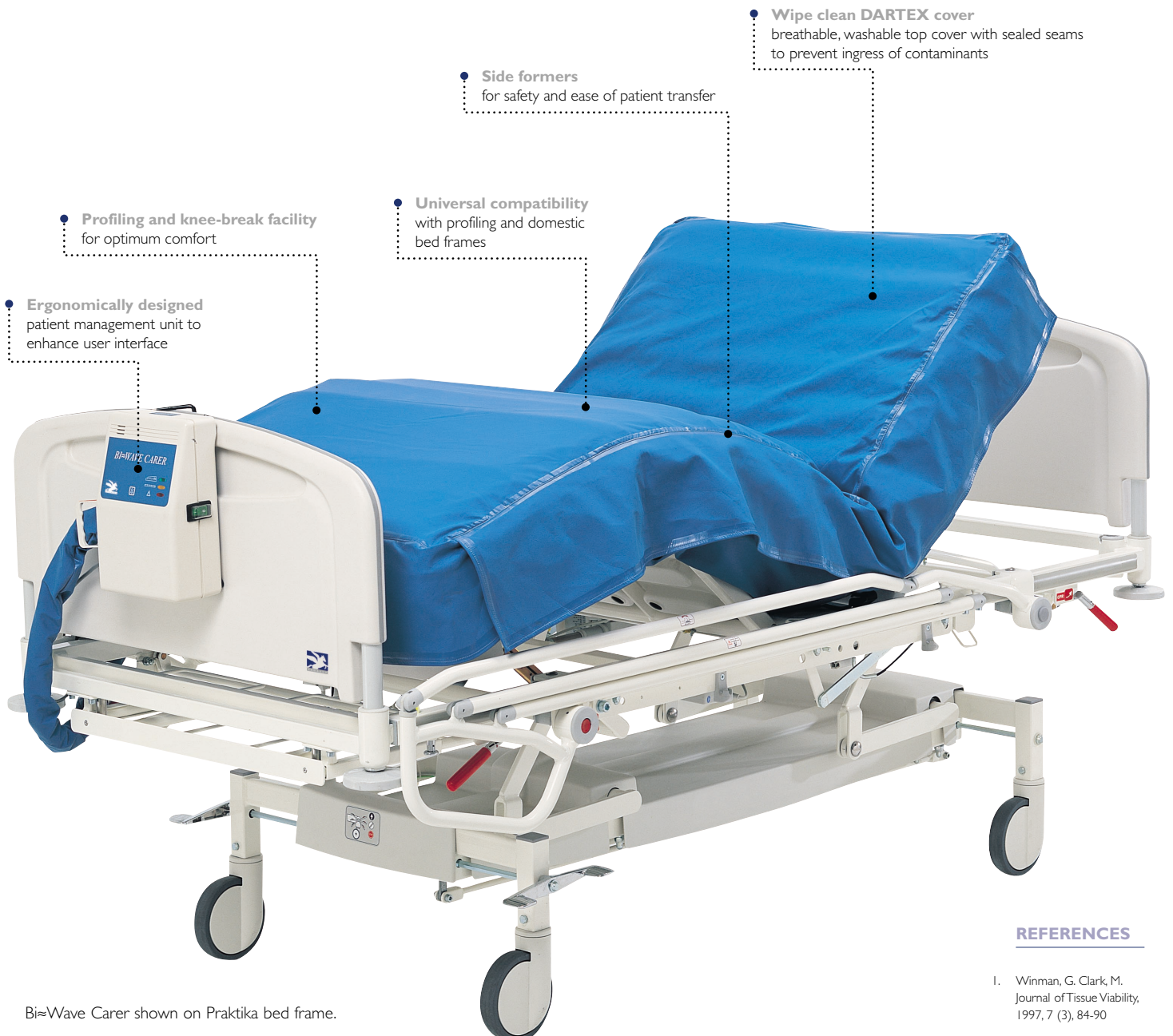
Bi≈Wave Carer shown on Praktika bed frame.