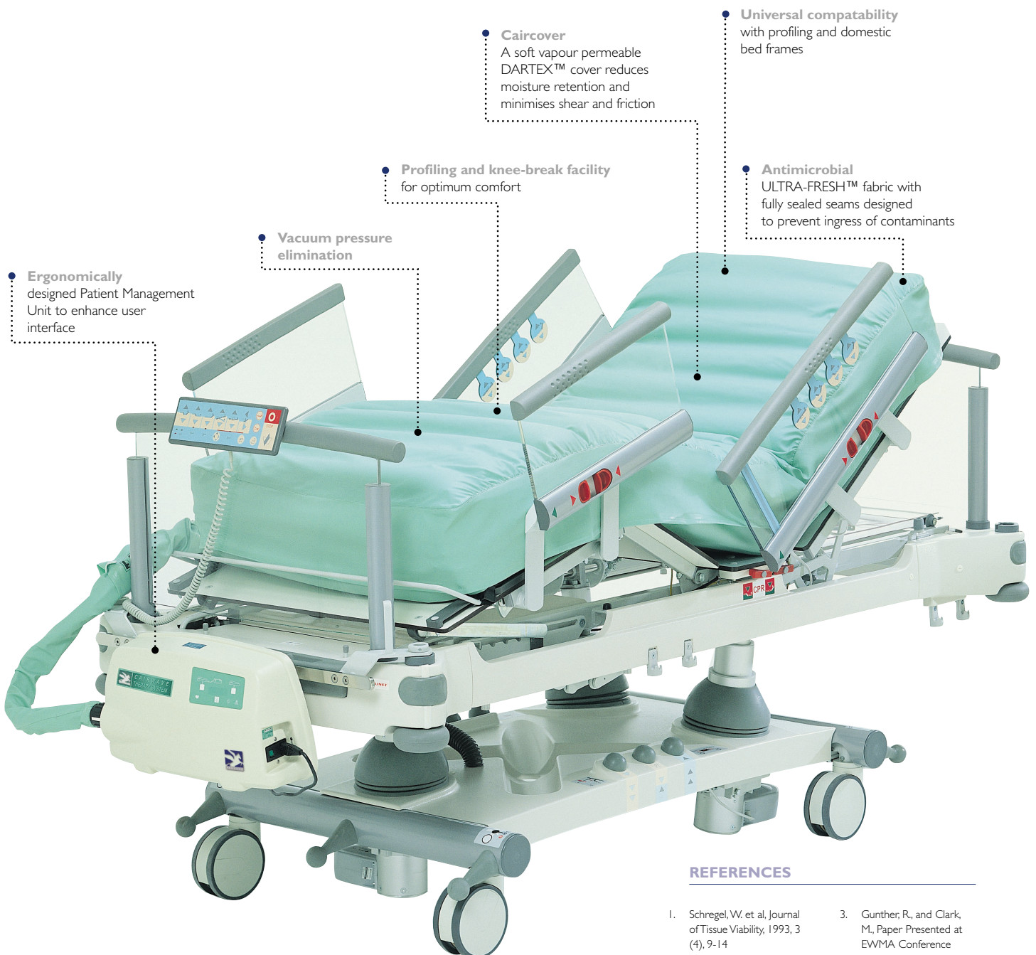
Cairwave shown on Multicare bed frame.